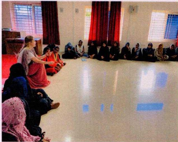
Students of I YEAR Department of Nutrition and Dietetics actively participated