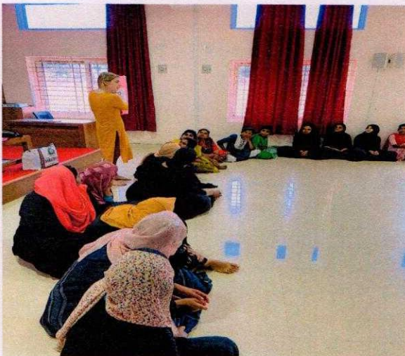
Students of III YEAR Department of Nutrition and Dietetics actively participated